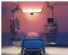
Fig.1: The new kind of lighting concept, AmbientLine, integrates soft lighting for the well-being of the patient and ergonomic work area designs for hospital personnel in ceiling pendants from TRUMPF.

Digital pictures are added to this press release. These are available in high resolution under www.trumpf.com > TRUMPF Group > Press > Media Services > Press Kits: